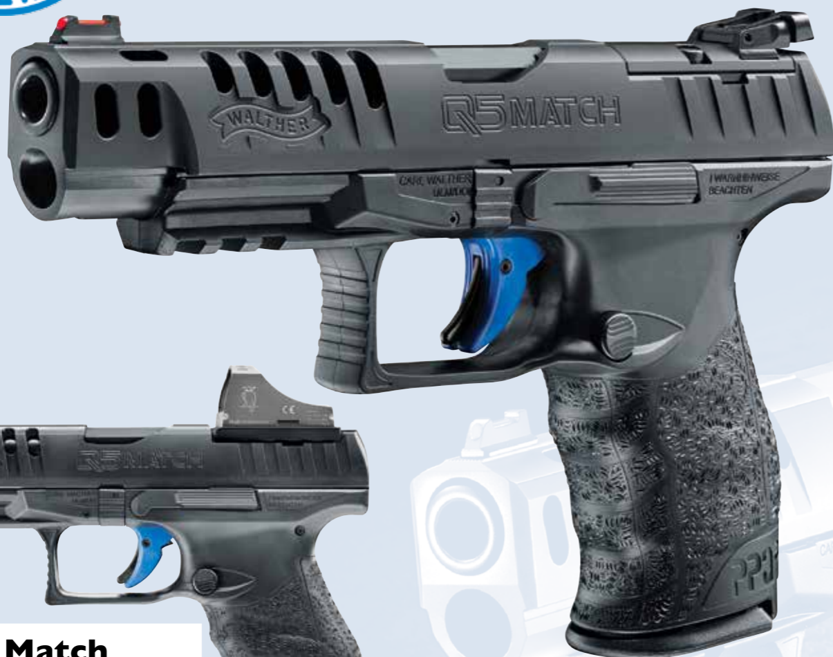
PPQ Q5 Match