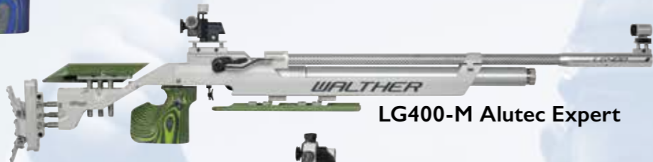
LG400-M Alutec Expert