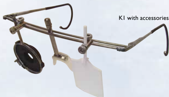
KI with accessories

Iris shutter Clips on lens holder Sharpens sight picture