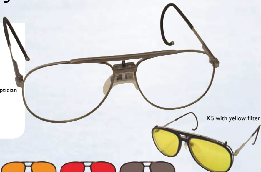
K5 with yellow filter

For shotgun and pistol shooting Height adjustable nose piece ensures the frames do not come into contact with the shotgun Different filters are available and can be swapped quickly to suit changing light conditions Supplied with blank lens, corrective lens can be fitted by optician Made of Nickel silver, high-grade steel, silicon, PVC Curlside ends are silicon covered for better comfort Spring hinge sides Includes: cased