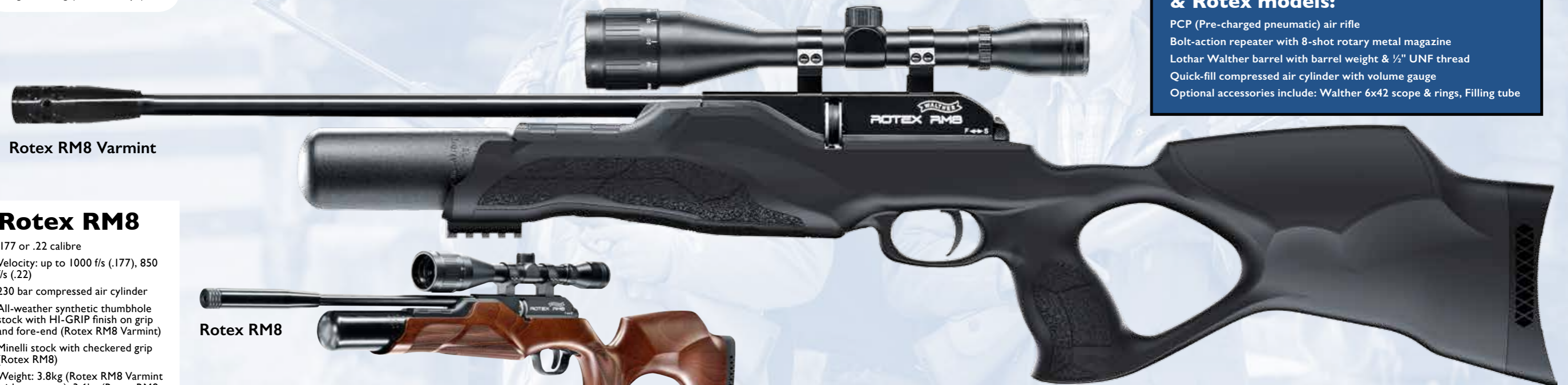
Rotex RM8 Varmint