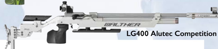
LG400 Alutec Competition