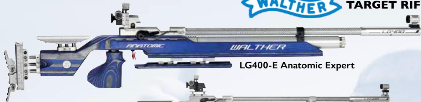
LG400-E Anatomic Expert